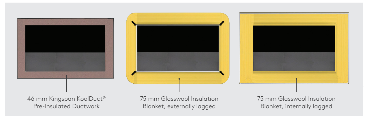
Figure 3. Kingspan KoolDuct ^{\circ} Pre-Insulated Ductwork achieves R2.0 in just 46mm thickness.